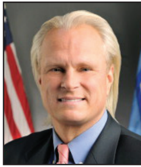
HON. BART CHILTON

The Honorable Bart Chilton serves as one of five Presidentially-appointed commissioners of the Commodity Futures Trading Commission. Known for his openness and his knack for boiling down complex issues into everyday language, Chilton will provide his perspective on impacts of high-frequency trading on agricultural futures markets. Chilton also will address the CFTC's efforts to provide better consumer education tools to futures market participants.