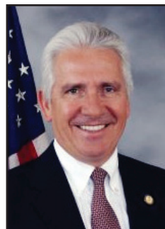
HON. JIM COSTA

The Honorable Jim Costa (D-Calif.) will present the convention’s opening address on priorities in the 113th Congress. Costa is a 5-term member of the House representing California’s heavily agricultural 16th district that includes the Central Valley. As a member of the House Agriculture Committee, Costa is well-positioned to provide an insider’s perspective on the big-picture budget and political issues driving events today and their real-world consequences such as impacts on the Farm Bill and on NGFA priority issues like rationalizing the Conservation Reserve Program.