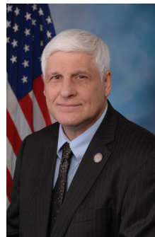
HON. BOB GIBBS

Rep. Bob Gibbs ( confirmed ), R-Ohio, has been invited to deliver the keynote address on Monday morning. A second-term member of the House, Gibbs serves on the Agriculture Committee and has been a key ally of the NGFA, especially regarding the structure of commodity programs in the recently completed Farm Bill. Gibbs will discuss the challenges facing Congress in today's volatile and fragmented political environment and upcoming legislative priorities.