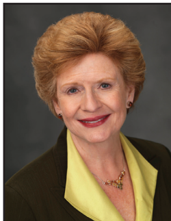
HON. DEBBIE STABENOW

The Honorable Debbie Stabenow ( confirmed ), D-Mich., chairs the Senate Committee on Agriculture, Nutrition and Forestry. In her second term representing Michigan, Stabenow will play a critically important role in writing a new Farm Bill this year. The NGFA enjoys a close relationship with Sen. Stabenow and anticipates working closely with her and her staff on Conservation Reserve Program reforms and other policy matters.